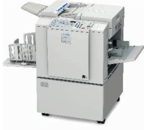
CopyPrinter DX 2430